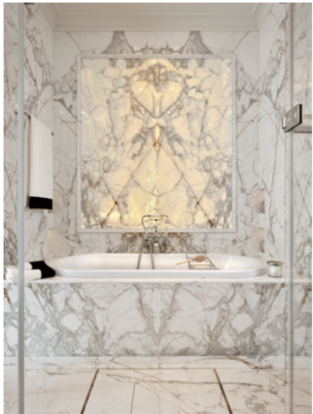
Sophisticated retro inspiration for the Devon&Devon taps and shower roses

The large master bathroom, with its extraordinarily striking aesthetic impact, welcomes the owners into a shared space in which each has their own exclusive, personal space: his and hers vanity units, two large shower heads, two windows, two small rooms where the sanitaryware is located and two retro-style Baccus towel warmers. The perfect symmetry of this couple-friendly space is developed round the large central bathtub, set between lightweight walls of extra-clear glass and Calacatta marble tiles so simple that they are almost transparent, hosting striking light effects in the backlit part.