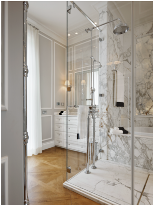
In the master bathroom, Frette for Devon&Devon textiles

The unusual, sophisticated design of the bathrooms and that of the small hammam are conceived as veritable wellness areas for mind and body, underpinned by the style and living philosophy of Devon&Devon.